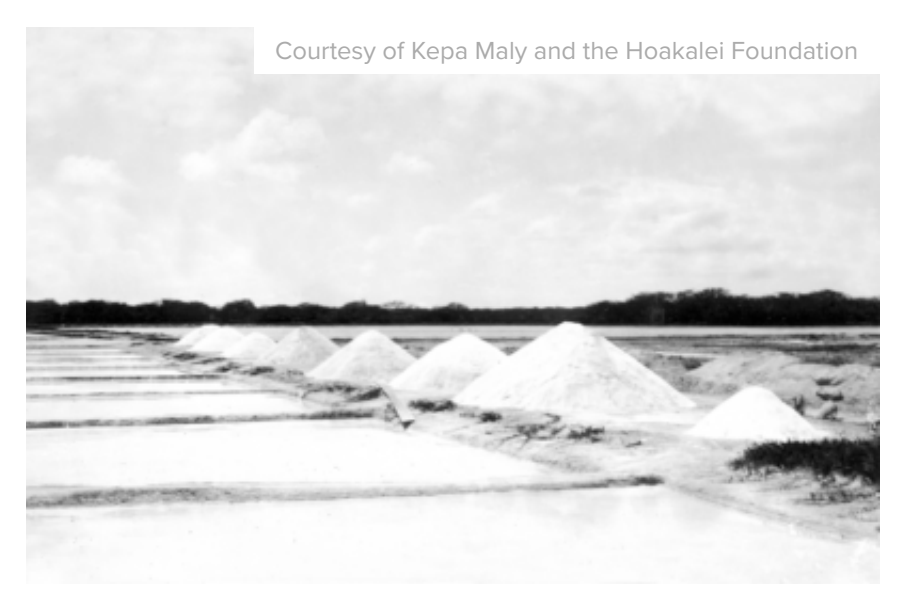
Large collections of salt from the Pu'uloa Salt Works in Ewa, Oahu, in 1909.

Throughout the 1800s and well into the 20th century, salt farming actively took place on all the islands. Hawaiian language newspapers and land documents evidence the extensive practice.