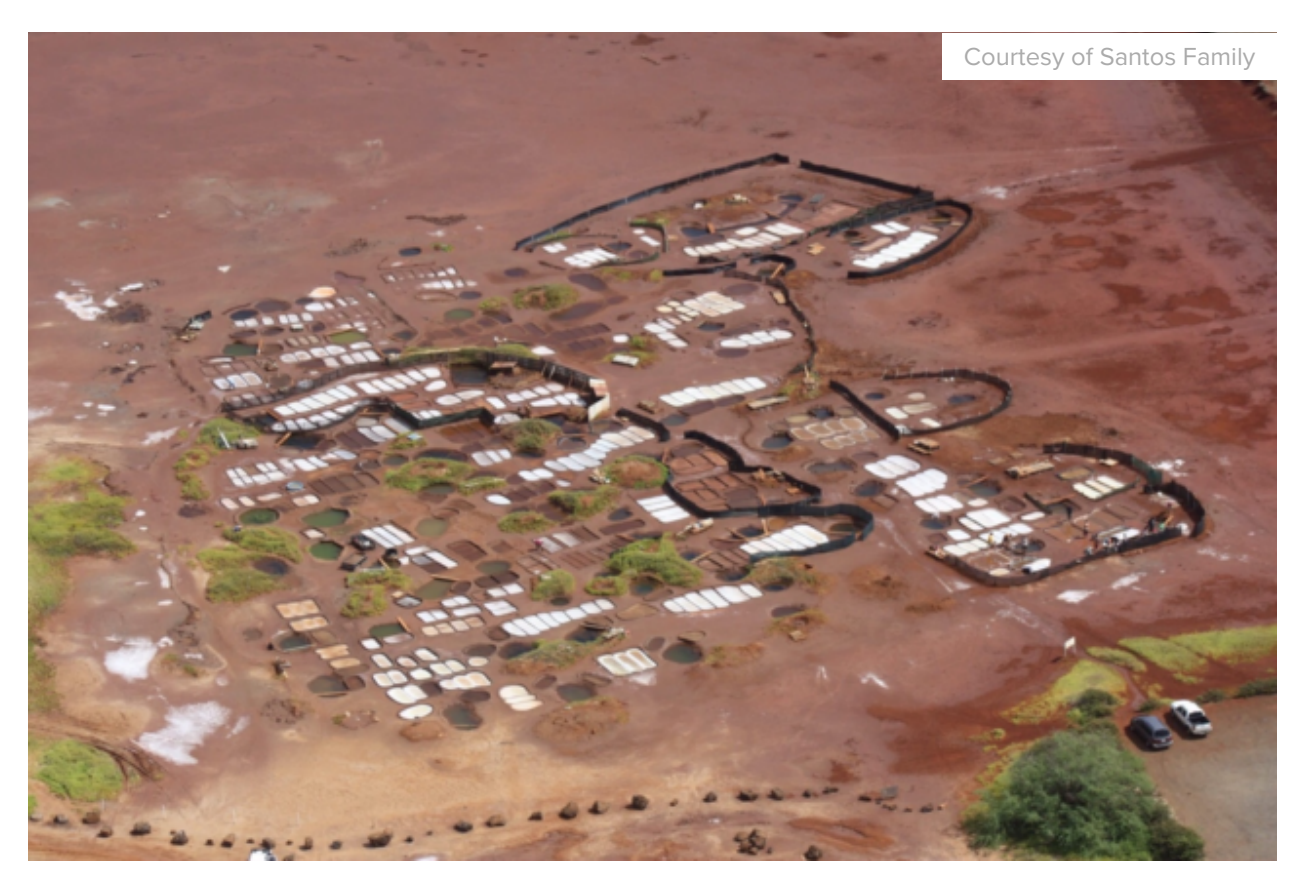
Over 20 Hawaiian families care for the Hanapepe salt ponds, which they have cultivated for generations.

The Delaware company, which operates across the United States, now seeks permits after the fact for its activities, much to the chagrin of the neighboring pa'akai practitioners.