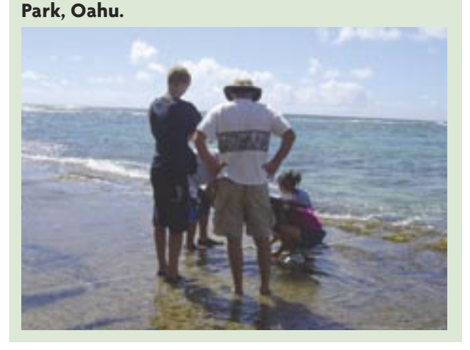
FIGURE 4 Collecting data at Diamond Head Beach

each sampling method would be appropriate. Students demonstrate understanding by identifying strengths, weaknesses, and different types of sites where each strategy would be optimal. Further application of knowledge can be demonstrated by developing a plan for sampling the school grounds, and subsequent to that, an additional field site. To do so, students must demonstrate that they understand how